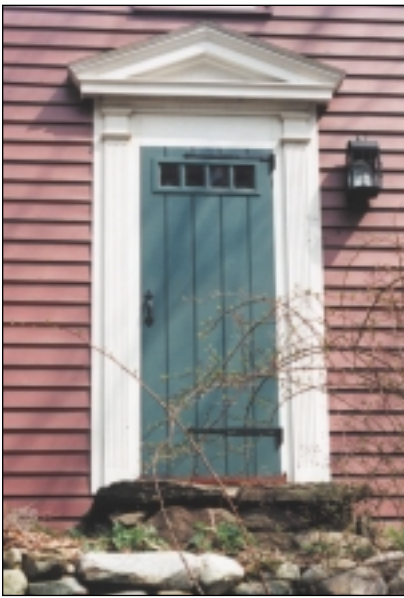
West Road, Monterey, Massachusetts, 2000. Featured on Doors of the Berkshires (poster).

Further research is needed to develop effective interventions to lighten the emotional burdens borne by family caregivers of relatives with cancer.